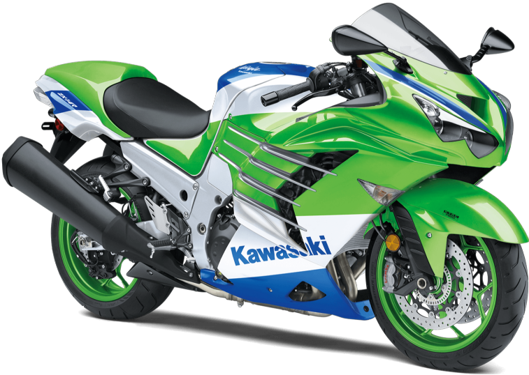
LIME GREEN/PEARL CRYSTAL WHITE/BLUE